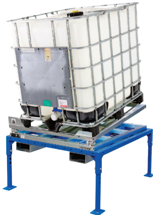
IBC Container not included