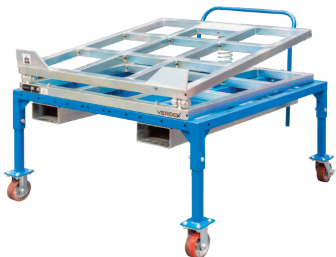
TR7905 Castor Kit pictured with TR7910