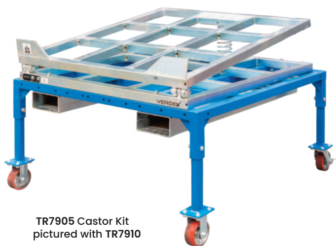
TR7905 Castor Kit pictured with TR7910