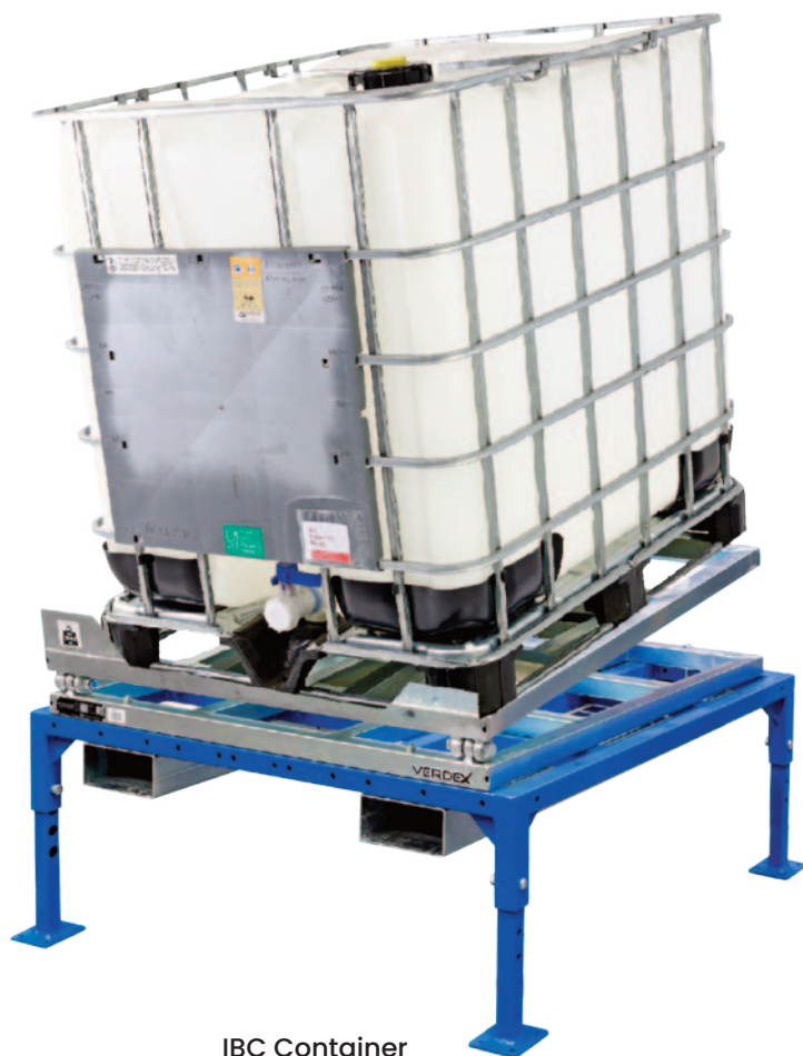
IBC Container not included