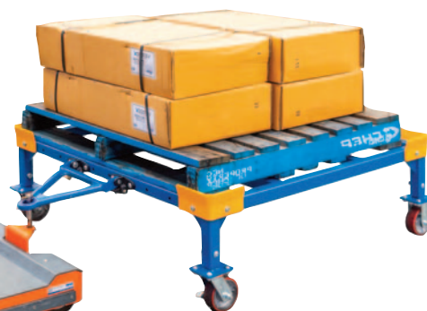
TR7908 pictured with TR7903, TR7905 & TR7907