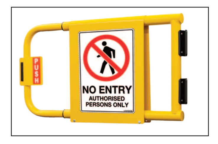
TR7477 pictured with safety signs