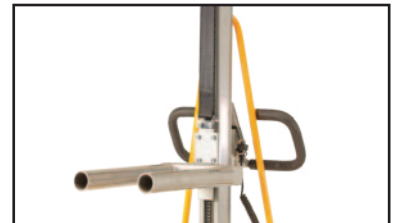
Double Prong Attachment (TR2204)