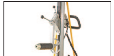
Reel Handler Rotator Attachment (TR2205)