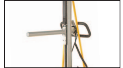
Roll Prong Attachment (TR2203)